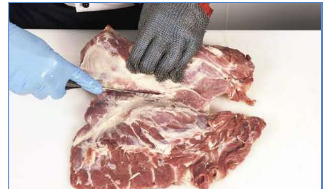
6 ... continue and separate the two muscles.