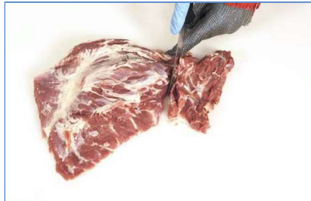
8 Remove the chain muscle ...