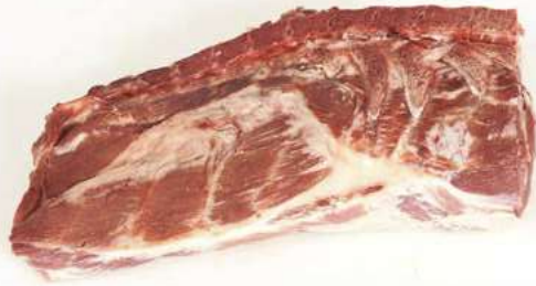
1 Pork Collar – bone-in.