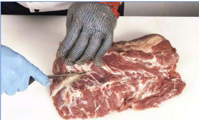
4 Starting with the remaining piece of the loin eye muscle, follow the natural seam to remove ...