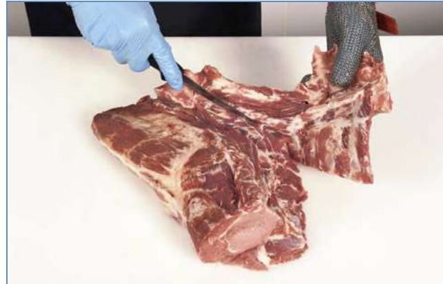
2 Remove the bones by sheet boning taking care not to cut into underlying muscles.