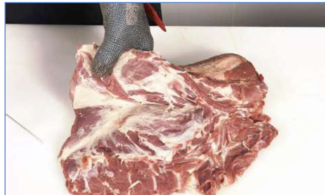
5 ... the muscle which lies on top of the Presa (Denver Muscle) ...