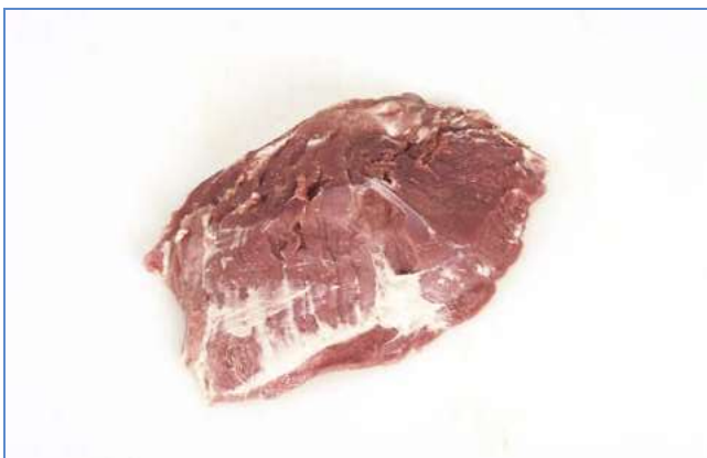
10 Fully trimmed Presa (Denver Muscle)