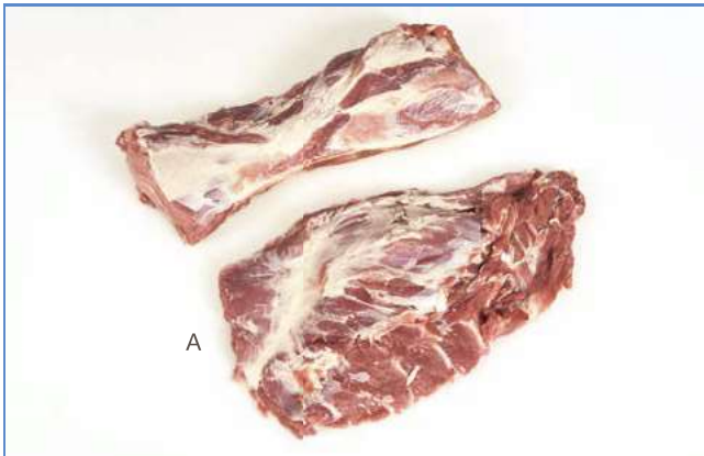
7 Presa - Denver Muscle (A).