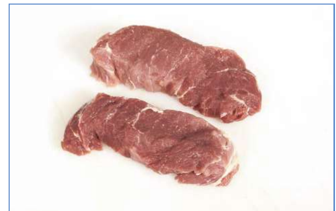
12 Presa Steak (Denver Steak).