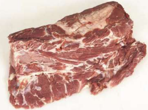
3 Boneless collar of pork.