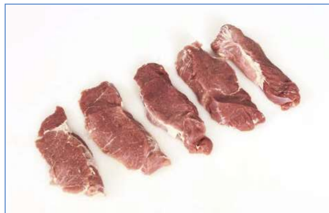
11 Cut muscle across the grain to create Presa Steak (Denver Steak).